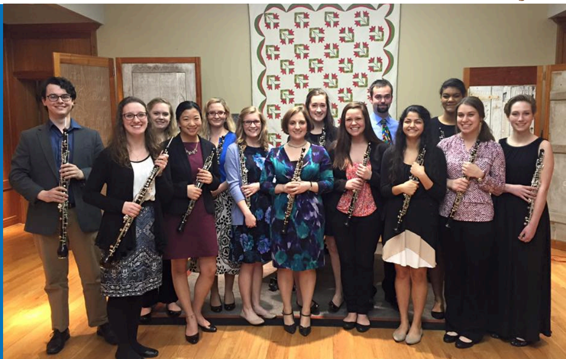
Members of the 2015-2016 UK Oboe Studio following our Studio Recital. (April 2016)