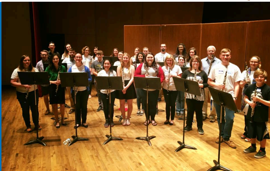
Above: The oboe participants from Double Reed Day (April 15, 2017).