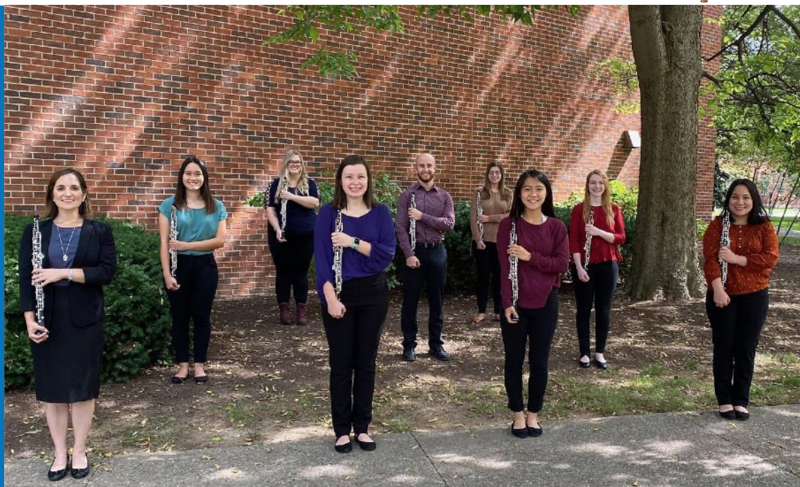
Above: The Socially Distanced 2020-2021 UK Oboe Studio